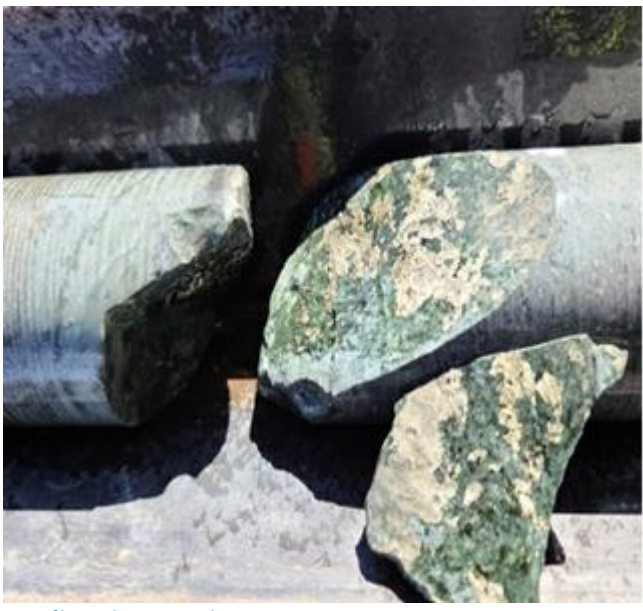
Reading Time: 5 Mins